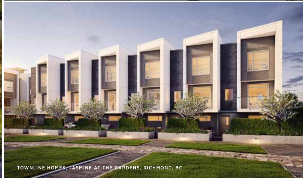
TOWNLINE HOMES, JASMINE AT THE GARDENS, RICHMOND, BC