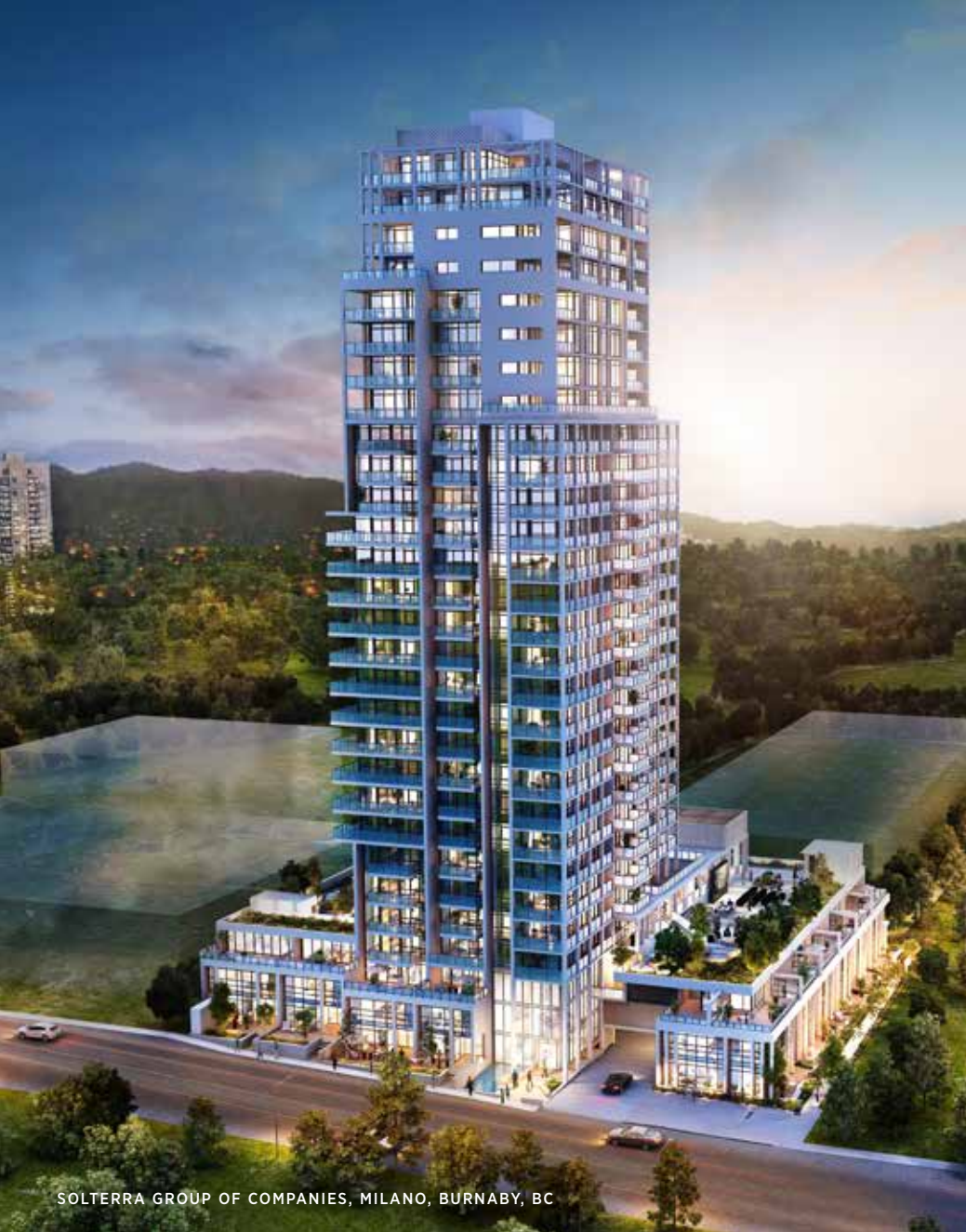
SOLTERRA GROUP OF COMPANIES, MILANO, BURNABY, BC