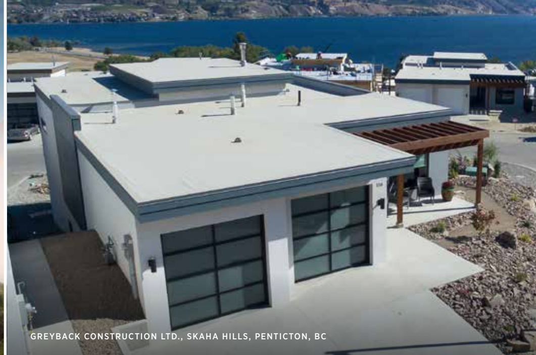
GREYBACK CONSTRUCTION LTD., SKAHA HILLS, PENTICTON, BC