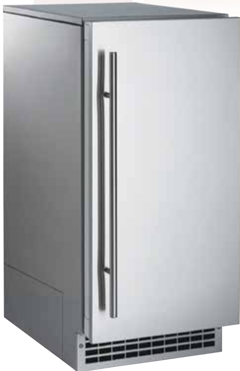
SS Model Shown