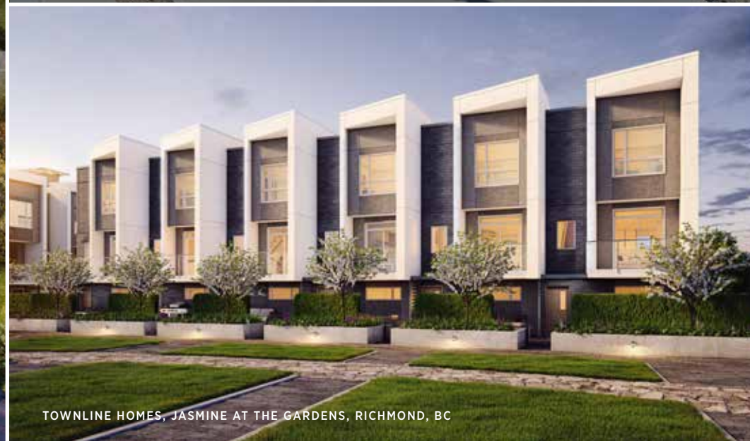
TOWNLINE HOMES, JASMINE AT THE GARDENS, RICHMOND, BC